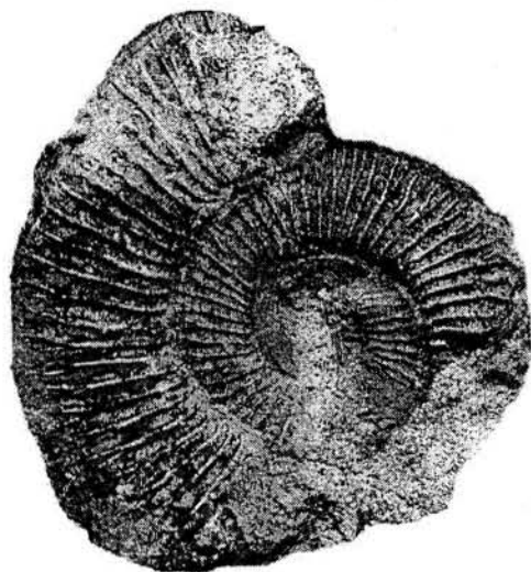
Fig. 3. Oloriziceras schneidi Tavera, 1985; specimen no. 376/1, lateral view, \times 1 ; Dvuyakornaya Bay; Upper Tithonian.

minate. The cross section is highly oval, most likely rounded-rectangular. The umbilicus is wide and shallow, with a steep wall.